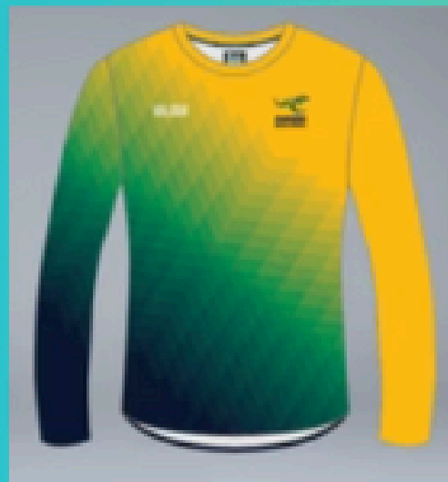
L/S training shirt