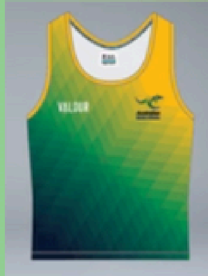
Lycra Crop Singlet