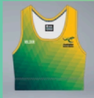
Lycra Crop Top